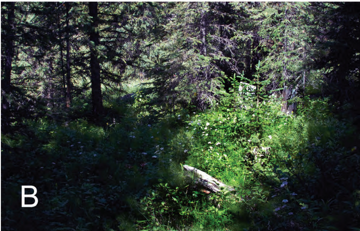
FIG. 3. Views of the same location from the same perspective in the middle of Beartooth site 1 from 29 July 1987 (A) and 31 July 2010 (B). Note the two stumps to the right. Over time, spruce, herbaceous vegetation, and willows have filled in what had been an open, flower-dominated site.