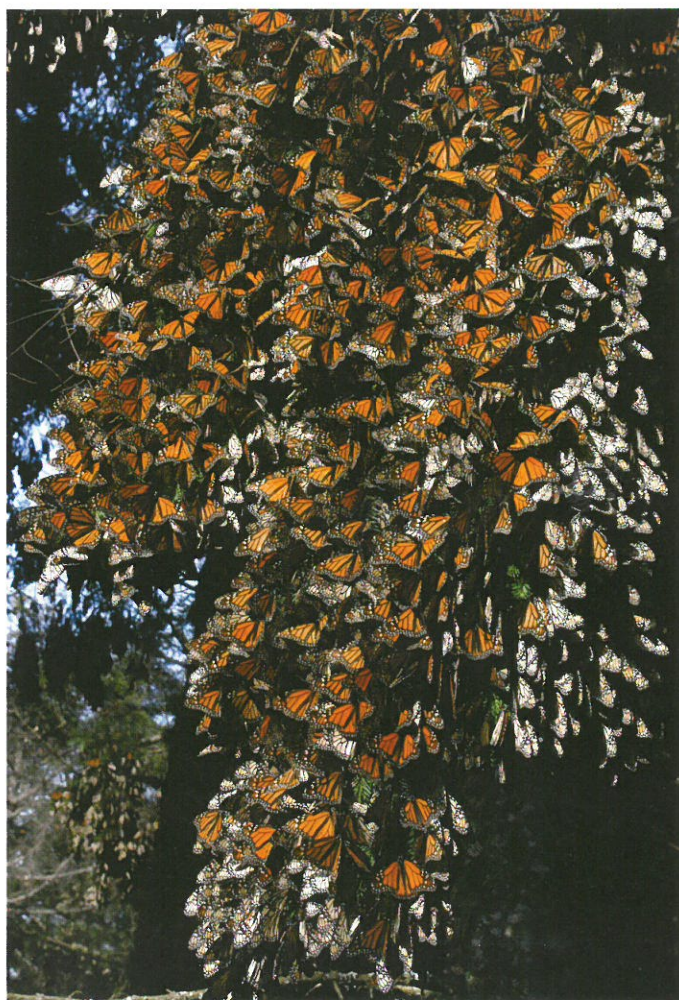
A monarch-draped oyamel fir bough in the Sierra Chincua colony, January, 2007.