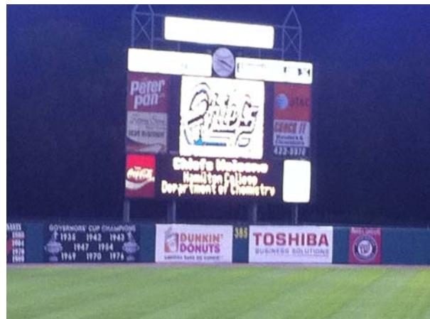
Hamilton Chemistry recognized at Chiefs game