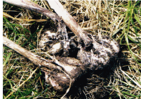
Garlic bulbs infected with the white rot fungus ( http://www.garlicworld.co.uk/images/rot.gif ).

White Rot ( Phanerochaete chrysosporium ): First observed in England in the mid-1800's, white rot tends to form in dry soil exposed to cool temperatures. The disease spreads rapidly when it attacks young plants. External signs of infection include yellowing and necrosis of leaf tips. Bulb scales may become spongy, become covered with white mycelium (the vegetative part of the white rot fungus), and develop black sclerotia (a compact mass of hardened sclerotia). Treatment with chemical agents such as mercuric chloride, lime, and 2,6-dichloro-4-nitroaniline has proven effective. 32