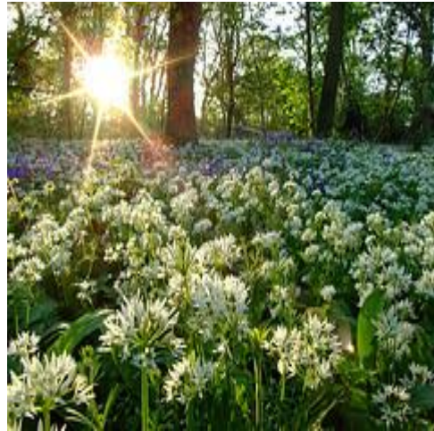
“Wild garlic”.

Garlic does not produce seed. Consequently, plant breeders have not been able to develop many types of garlic cultivars. Growers must usually set aside at least one-tenth of their spring crop to be broken into cloves for planting in the fall. 73 If breeders consistently plant garlic in the same location for an extended period of time, the particular strain will develop specific characteristics, such as a particular external color, a certain number of cloves, or a certain bulb size. 74 Of course, because garlic responds dissimilarly to differences in soil composition, day lengths, climates, and altitudes, local growing conditions can alter the strain and produce varieties with new features. 75