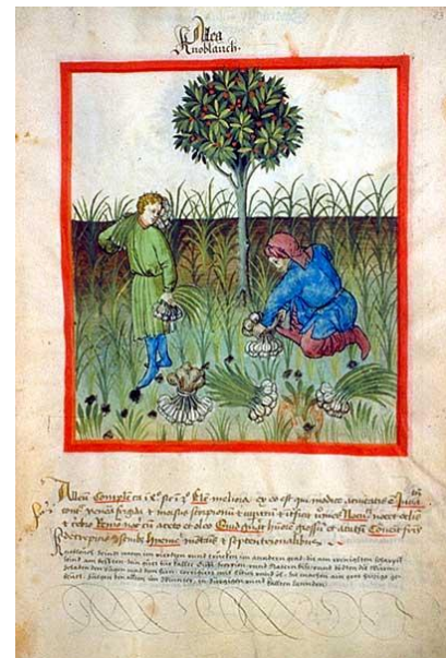
15 th century illustration of a garlic harvest from Tacuinum sanitatis , the Medieval handbook of wellness from Arab medicine ( http://en.wikipedia.org/wiki/Image:Tacuinum_sanitatis-garlic.jpg ).

Later in the seventeenth century, Dioscorides and Pliny the Elder's theories about garlic still held a high position in the field of medicine, but its ability to protect against diseases