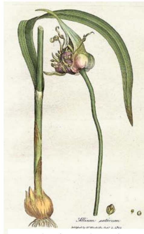
Illustration of the garlic plant in Medical Botany by William Woodville (1793), from http://en.wikipedia.org/wiki/Image:Allium_sativum_Woodwill_1793.jpg .

Garlic has been cultivated in the Middle East and Far East for at least 5,000 years and, as such, has been a valuable source of food and medicine, as well as a prized component of specific rituals, for many different societies. In Egypt, tomb art dating from the Early Dynastic Period (2925-2575 B.C.) depicts the consumption of garlic. Moreover, an Egyptian medical text called the Codex Elasers, which dates from approximately 1500 B.C., describes nearly two-dozen garlic preparations used to combat