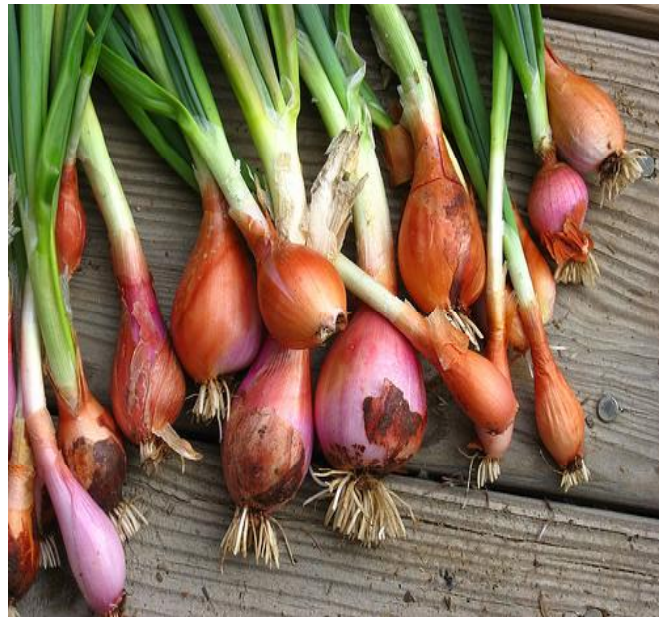
“Harvested onions” (Egyptian “Walking” variety)

Growing onions from seed requires a different series of steps. The eighteenth-century farmer and journalist William Cobbett discusses in The American Gardener three ways by which to produce crops from seed. The first approach suggests that growers plant seed thinly to depths of two inches and in rows one foot apart. The seed is raked over and the plants are thinned to four to eight inches once they reach a height of three inches. When the leaf tips turn brown, the necks of the leaves are bent to the ground. The onions are pulled up when the leaves are nearly dead, and are thereafter dried and stored. The second approach involves each of the aforementioned steps, but instead of planting seeds one foot apart, growers are encouraged to sow a handful every six to seven inches. This approach does not allow for the development of large onions,