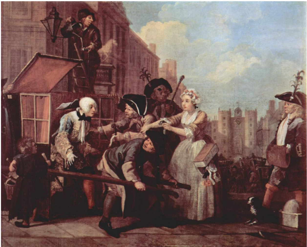
18 th -century English artist William Hogarth produced a series of eight paintings titled “A Rake’s Progress” (1732). The fourth painting, titled “The Arrest,” illustrates the customary Welsh tradition of wearing a leek in ones hat on St. David’s Day ( http://en.wikipedia.org/wiki/Image:William_Hogarth_026.jpg ).

Leeks play an integral role in Welsh culture. They are one of the national emblems of Wales, and have been featured on the one pound Welsh coin—those minted in 1985. 127 In addition, leeks play an important cultural role in the Welsh national holiday, St. David's Day (March 1), named after St. David, the patron saint of Wales. 128 Sixty years after St. David's death (approximately 640 AD), the British King Cadwallader was attacked by the invading Saxons. According to legend, the Welsh, to distinguish themselves from the enemy, wore leeks in their helmets. This battle, known as the Battle of Heathfield, was won by the British. To honor this victory in the name of St. David, it is customary for residents of Wales to wear a leek or a daffodil in their pockets or hats on March 1. 129