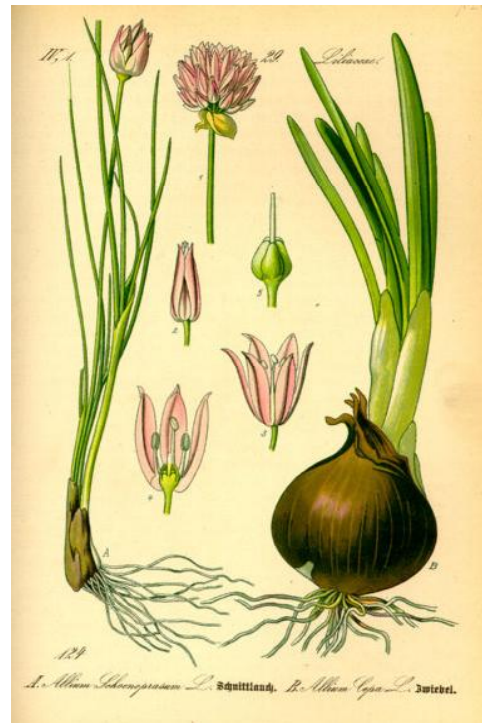
An illustration of a chive and onion Flora von Deutschland by Dr. Otto Wilhelm, 1885 ( http://en.wikipedia.org/wiki/Chives ).

Onions were originally native to central Asia, but today have a worldwide geographic range. They made their way to Egypt via trade, where they became a crucial food plant in the ancient world. Because onions were a cheap source of food, Egyptian slave laborers, those who constructed the pyramids, consumed them on a daily basis. 3 In addition, they were depicted in the funerary paintings in tombs and even placed on and around mummies. 4 Ancient Sumerians widely grew and cooked onions 4,000 years ago, and the plant has been discovered at the royal palace at Knossos in Crete. 5 Additionally, the ancient Greek physician Hippocrates wrote in the fifth and fourth centuries B.C. that a broad variety of onions were eaten regularly in Greece. 6 In ancient India, however, there was a fair amount of revulsion to onions. Orthodox Brahmins, Hindu widows, Buddhists, and Jains regarded onions as forbidden vegetables because of their strong odor and stimulating action. 7