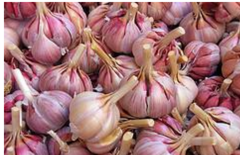
“Garlic”.

Of course, the image of garlic as a “stinking rose” in England and the U.S. has largely subsided, particularly in the latter case. In 1924 the caesar salad was introduced in Tijuana, Mexico for American diners. The dish was prepared by rubbing a salad bowl with a clove of garlic to enhance the flavor of the lettuce, and almost immediately gained acceptance in the States as “American” food. 94 Thirty years later the food writer James Beard wrote about an old Provençal recipe that called for cooking chicken with forty cloves of garlic. Thousands of readers tried the recipe and enjoyed it. Evidently, garlic usage and consumption has increased fourfold since the early-1970’s. 95