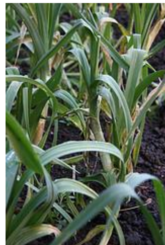
“Leek harvest”.

A popular Scottish equivalent to the French vichyssoise is cock-a-leekie. This particular soup, like vichyssoise, contains leeks and potatoes, though chicken stock is also added. The original recipe featured prunes, and some cooks will garnish the soup with julienned prunes. Leeks are also included in stews such as the French pot-au-feu, which consists of low-cost cuts of beef and is slow-cooked, and are occasionally employed for use in vegetable and meat stocks. 126