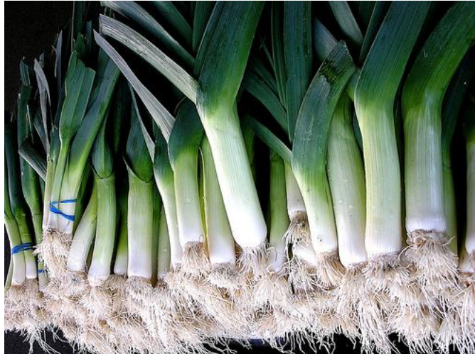
“Leeks” ( http://www.flickr.com/photos/calliope/54833240/ ).

Leek is characterized by the formation of a pseudostem, which in some cases can exceed lengths of one meter, as well as a poorly developed bulb. Pseudostem is the term for the overlapping leaf bases of the leek, which tend to be flat and slender, and fold over each other to create a stemlike structure. Botanically, however, the edible part of the plant is not the stem, but rather the elongated leaf bases. 107