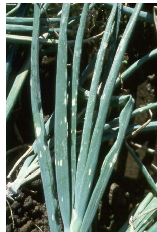
Downy mildew on onion stems ( http://mtvernon.wsu.edu/path_team/Disease%20Gallery/dg94L.jpg ).

Downy Mildew ( Peronospora farinosa ): First reported in England in 1841, this fungus spreads rapidly in wet and humid conditions. When attacked, bulb tissue softens and shrivels, and the outer scales become amber-colored, watery, and wrinkled. Early infection can kill younger plants. Surviving species can appear dwarfed, pale, and distorted. The seeds from infected plants can affect entire crops if sowed. Treatment with 2 percent of the pesticide Zineb in sprays and dusts has been shown to control the spread of mildew. 29