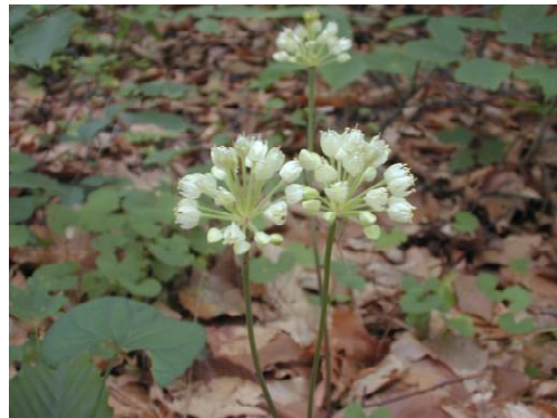
Wild leek flowers (David Gapp).

Leek starts from seed and require a rather long growing season to reach an optimal marketable size—usually at least two feet in height or about an inch in diameter. 113 In cool climates, leeks are often planted as early as possible in the spring, and are typically transplanted from hotbeds or cold frames into the open once the soil warms. Early plantings are generally ready by late summer, though leek can be harvested in any season. Production tends to be greatest, however, in late autumn, winter, and early spring, and lightest in summer. 114