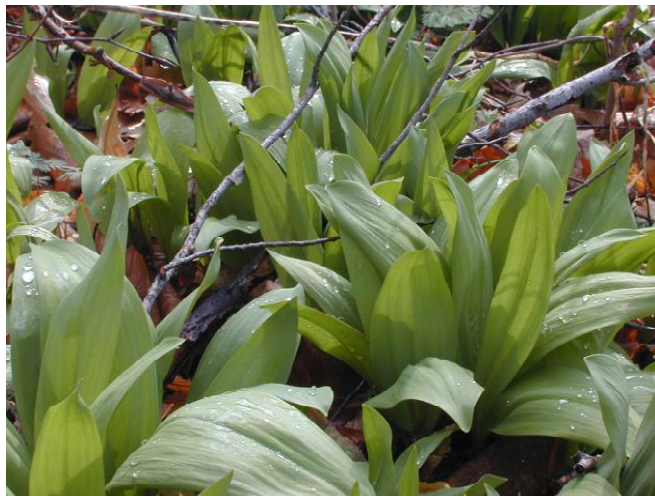
Wild leeks in upstate New York.

Leek is a relatively hardy species that, unlike onion (and to a lesser extent garlic), does not have specific photoperiodic requirements for pseudostem formation. (Photoperiodic response refers to the amount of time the pseudostem must be