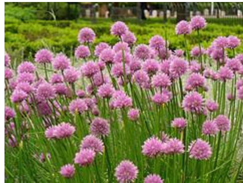
“Chives”.

The most common method of planting involves seeding chives in single rows with about fourteen inches of space between them. A gap of thirty inches appears between every four or so rows. Because chives is dormant in the winter, growers will often seed the vegetable midway through summer, allowing them to harvest in mid-fall and then again in early-spring the following year. Leaves and flowers typically develop in abundance during the spring and in early summer, and it is this part of chives that gets consumed. (Bulbs do not get eaten because they are not well defined.) Growers can even harvest over successive four- to five-week intervals throughout the summer and autumn, for chives will continue producing clusters of leaves and flowers well after spring harvest. 138