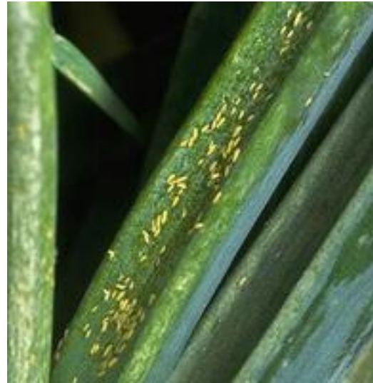
Onion thrips on an onion stalk ( http://www.entomology.umn.edu/cues/inter/inmine/inimage/onionthrips.jpg ).

Depending on the variety, growing conditions and climate, the nutritional value of onions can vary. They are very low in calories, only about 30 per one half cup serving, and fat, sodium and cholesterol free while still being very flavorful. Onions are also a good source of vitamin C (5mg or 9% of daily value), B6 (0.1mg or 5% of daily value), potassium (126mg or 4% of daily value) and the flavonoid quercetin and trace mineral chromium. 37