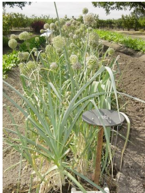
Garden leek with overlapping leaves forming the pseudostem ( http://en.wikipedia.org/wiki/Leek ).

drawings and designs of the plant. 104 The ancient Greeks enjoyed leek as a source of food, as did the Romans, who preferred it to garlic and onions.