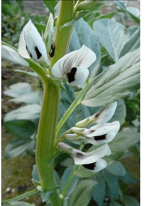
Fava Bean Plant Pic 12