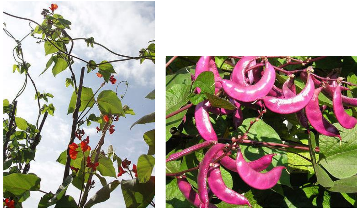
Bean Plant Pic 3