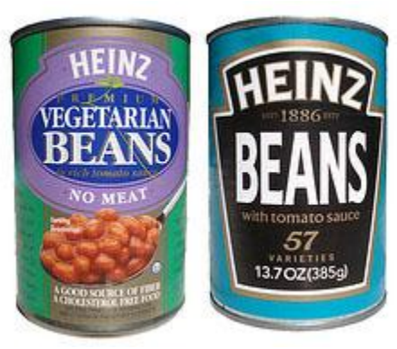
Some Canned Varieties Pic 11

Explorers brought the dried peas to America in the seventeenth century at the same time traders introduced sugar peas to China and Japan. The Chinese are credited for taking these tender-podded peas and creating new varieties such as snow peas (Weaver 59). Until this time peas and beans alike were typically eaten after they had been dried. Gardeners in Europe began to offer the food fresh, which was a popular development, and garden peas became an addition to middle-class gardens (Albala 76). The Dutch had been breeding varietals for some time, but the French King Louis XIV "made green peas fashionable" (Weaver 59). However dried beans remained practical as stored food. Dried navy beans have been part of sea fare for some time, and Lewis and Clark were known to travel with a supply of the beans (Albala 171). By the nineteenth fresh peas were a typical side dish and were among the first canned vegetables in the 1920s (Smith 251).