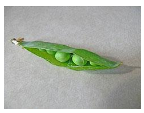
A Dehiscent Pod Pic 2

The distinctive fruit is the most ready resource by which to identify members of the Leguminosae family. This fruit principally grows into a pod that contains the seeds of the plant. The legume pod is a one-celled seed container formed by two sealed parts called valves. Legume pods always split along the seam which connects the two valves. This characteristic is called dehiscent, from the Latin word meaning to gape or burst open (Earle 5). However, not all pods are shaped the same. The thickness, length, curve, and fleshy nature of the pods can vary between species. In addition, some pods are winged or indehiscent (meaning the pods do not split open at maturity) (Morris 365). Colors of flowers and seeds vary greatly from white to scarlet to blue.