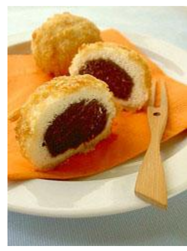
An Anko-filled desert Pic 18