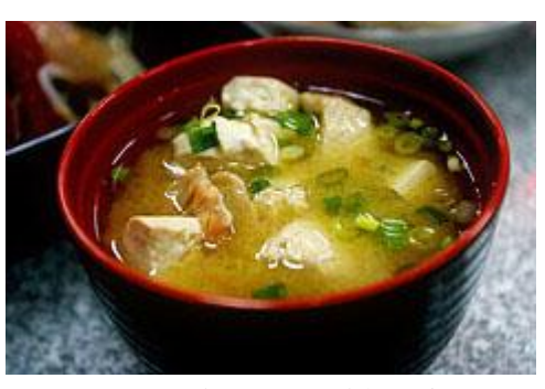
Miso Soup with Tofu Pic 19