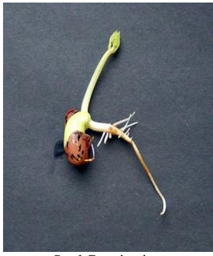
Seed Germination Pic 9

After water has been taken up by the seed, the coat bursts and the root starts downward growth into the soil. The hypocotyls then elongate and bend, forming a hook which is forced upwards through the soil. The cotyledons and shoot apex are then raised above the ground by a gradual straightening of the hypocotyls (Duffus & Slaughter 13).