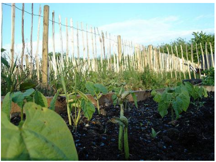
Dwarf Beans Pic 8

The bush or dwarf bean may be sown in drills, 20 inches apart, 2 inches deep, 2 inches apart, and 6 inches apart in the row. The Running or Pole Bean should be planted in hills, three and a half feet distant each way. We prefer setting the poles before planting...then dig and loosen the earth, and drop five or six beans in a circle around the pole, about 3 inches from it, and cover with mellow dirt (Buchanan 72).