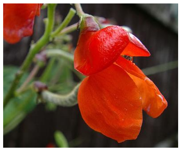
Typical Bean Flower Shape Pic 1

Unique to Fabaceae are the flowers and fruit. Like many flowers, those found on legume plants are hermaphroditic, containing both the stamen and pistil. This makes the plants self-fertile, meaning that an individual plant is able to reproduce by itself which can have the effect of limiting genetic diversity. However, hybridization occurs frequently in nature due to this characteristic, as any plant can pollinate another due to the hermaphroditic properties therein (Weaver 57). This creates difficulty in clearly defining the differences that enter between subspecies. The flower typically has five petals and an ovary with one carpel, cavity, and style (Morris 365). The distinctive nature of the flowers is not in the parts but in the shape of the parts. The general pattern of legume flowers follows that of the pea blossom. The result of this arrangement is that of a papilionaceous design, which means butterflylike (Earle 11). The petals of the legume plant are shaped into a cup. One large petal, the 'banner' or 'standard' folds over the rest for protection. In front of this petal are two narrower petals called 'wings,' between which two other petals unite. Due to their shape these petals are referred to as the keel. Within that fold are the stamens and pistil (Earle 10). After pollination the flower will die and reveal the growing ovary which becomes the pod.